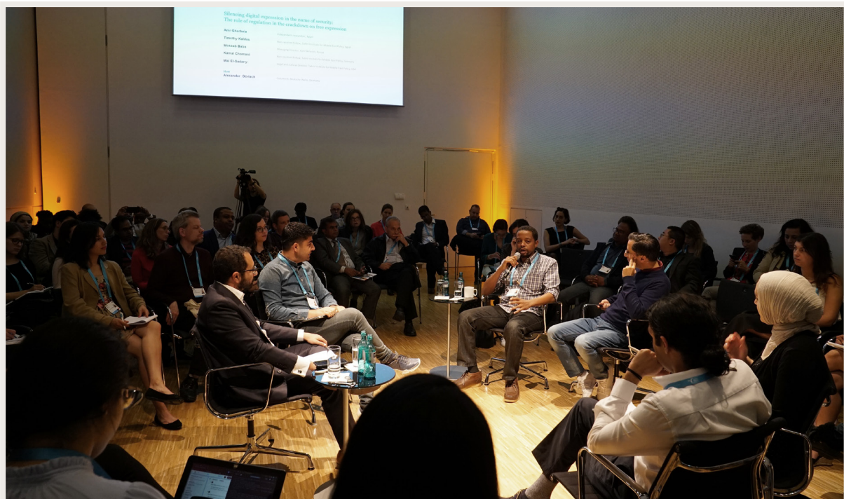
TIMEP's panel at the Deutsche Welle Global Media Forum (photo via flickr account Deutsche Welle Unternehmen).