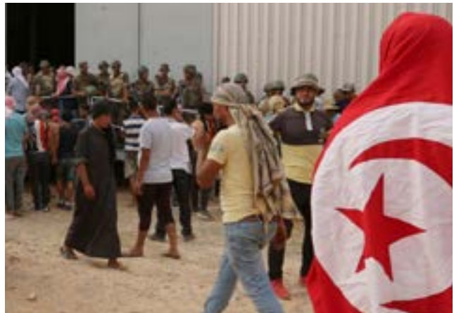
Tunisian protesters gather inside the oil and gas plant in el-Kamour, in Tunisia’s southern state of Tataouine, on July 16, 2020.

accountability. These developments positioned TIMEP to serve as a platform for changemakers in and from the MENA region and as an agenda-setting resource for decision makers around the globe