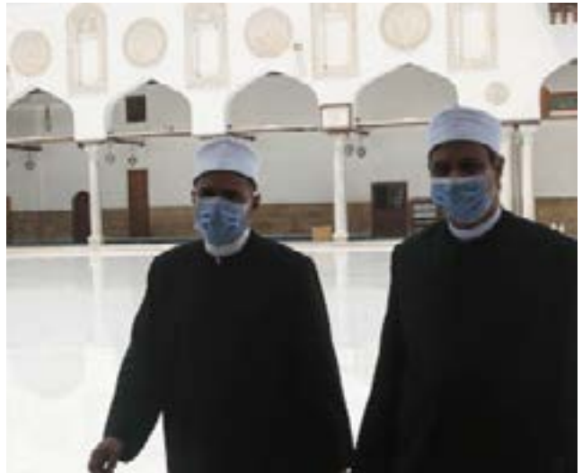
Egypt allowed Friday prayers to resume in major mosques under strict preventive measures against COVID-19.

More specifically, TIMEP expanded its Arabic editorial coverage by investing in translation and editing support, marking significant progress in the publication of Arabic content on its website and the translation of pieces originally written in Arabic into English—both of which TIMEP regards as essential in centering localized perspectives.