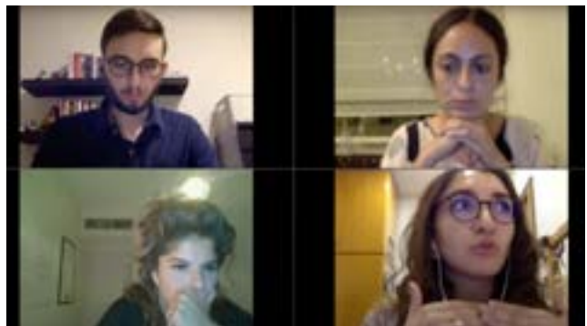
TIMEP hosted its first virtual event, “Food Security, Economy, and Accountability in the Wake of the Beirut Blast.”