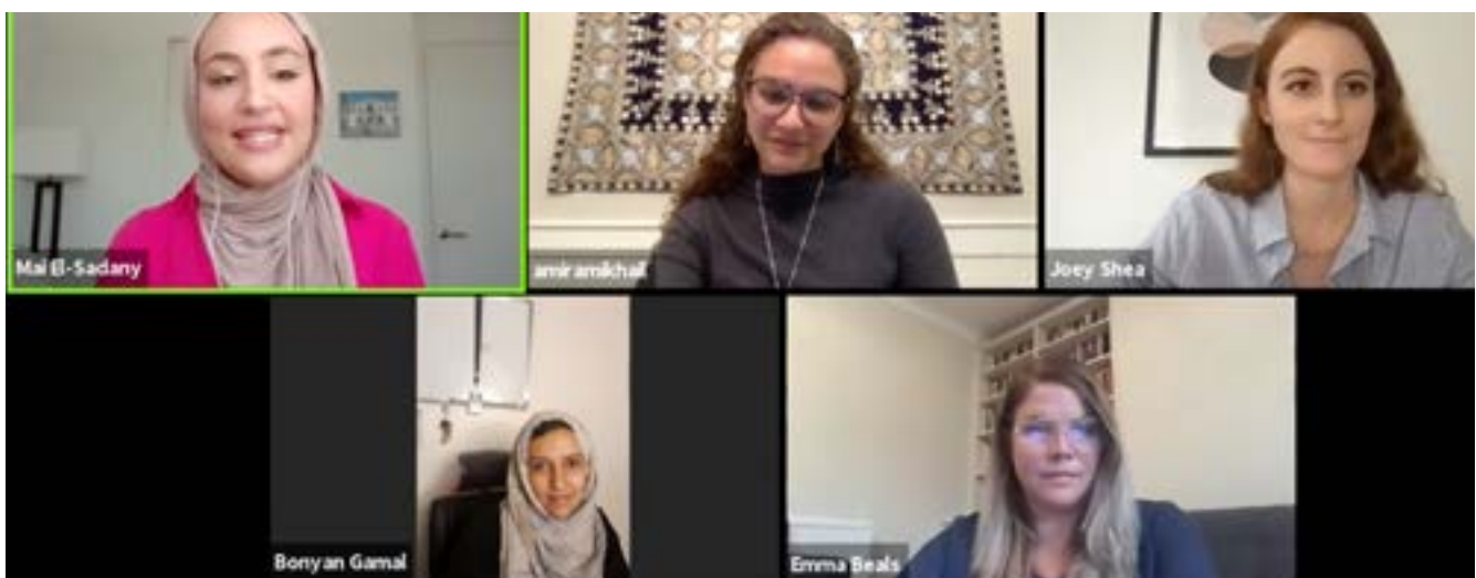
TIMEP and Eshhad hosted a virtual panel at RightsCon2020 to discuss, “Data Collection and Open Source Investigations: Advancing Accountability and Justice in the Middle East.”