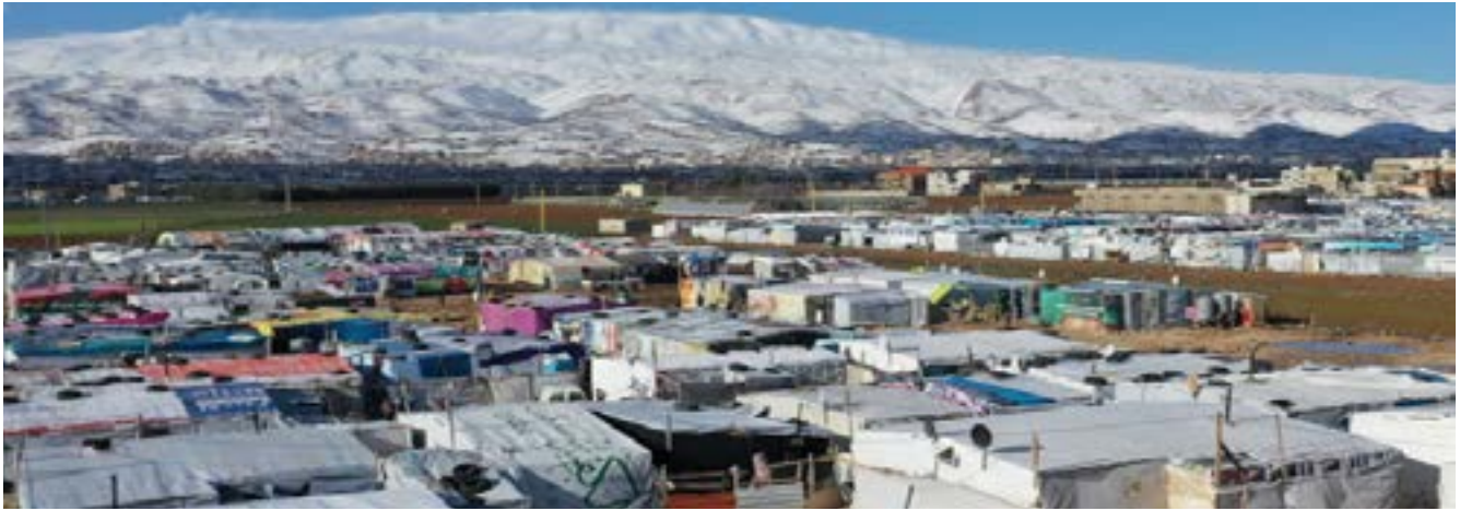
An aerial view shows an informal tent settlement housing for Syrian refugees flooded by rain water in the central Bekaa Valley.