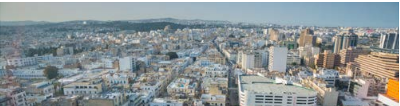
Aerial view of Tunis, Tunisia

Top photo: Anti-government activists chant slogans during a protest in Beirut.